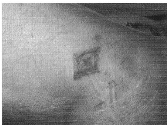
Fig. 3: Pathognomonic urticarial plaque at the injection site ("diamond skin disease")

ELISA before testing (Cussler et al., 1998).