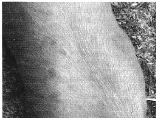
Fig. 4: Generalised erysipelas infection

In acute erysipelas, a high body temperature may occur without any skin reactions. This can happen when the infection dose is very high or when the