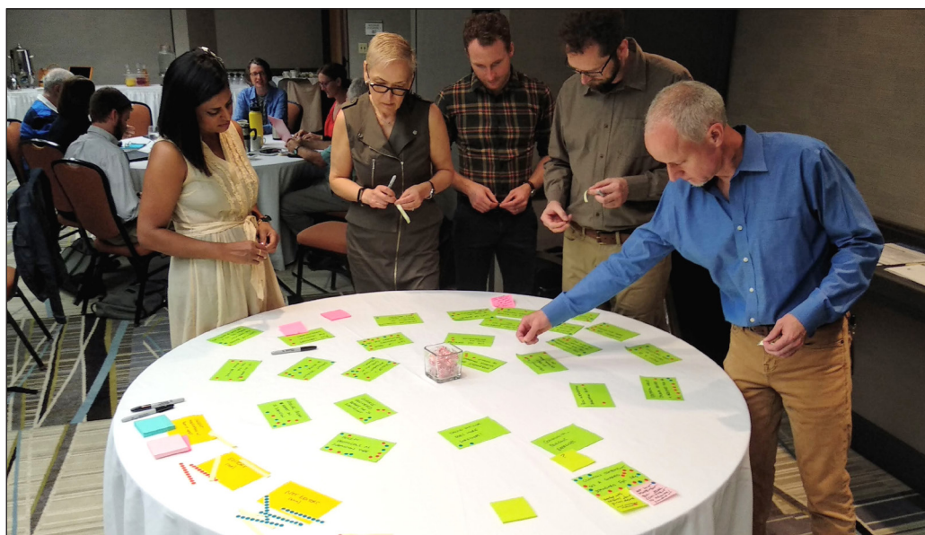
Photograph 1: The prioritization exercise conducted as the fifth breakout session

Each post-it note describes an intervention proposed during the previous day's breakout sessions. Participants were given 10 stickers (red for editors, blue for other participants) to indicate their 10 favored interventions. The results of the voting exercise fed into the subsequent consensus-building breakouts (sixth breakout) and final plenary session (seventh breakout).